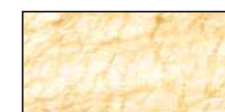
Sheet of OASIS® Wound Matrix